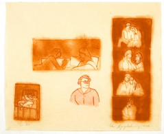
8. Yes, You Can , 1996 photogravure on Okawara machine-made paper with hand-torn deckle 13 ¾ x 16 ¾" Edition: 100 $3,000