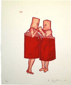
7. Potatoe , 1992 lithograph 22 ⅜ x 18 ½" Edition: 75 $3,000