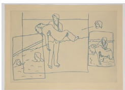
10. Vellum Sketches I , 2011 Sugar lift aquatint Paper: 20 ⅝ x 29" Edition: 25 $3,500