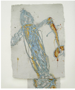
6. Prada Progeny , 2005 From a Suite of Four Prints digital print Paper Size: 25 ¼ x (w-1), 12 ½ (w-2), 7" Edition: 10 $6,000 each