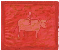
9. Untitled (Girl with Cow) , 2003 monoprint 15 x 17 ¾" $5,000