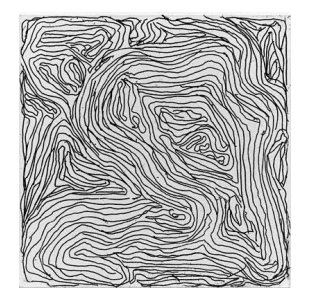
Sol LeWitt Small Etchings/ Black & White No. 8, 1999

Hard ground etching Image size: 4 x 4" Paper size: 8 x 8"